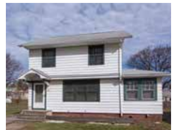
394 Laurelton Rd