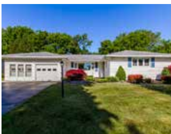
145 Andrea Ln - 3 offers!