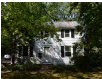
3942 Culver Rd - 3 offers!