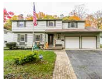
42 Pine Tree Ln - 3 offers!