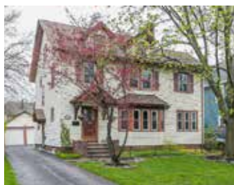
126 Hurstbourne Ln - 14 offers!