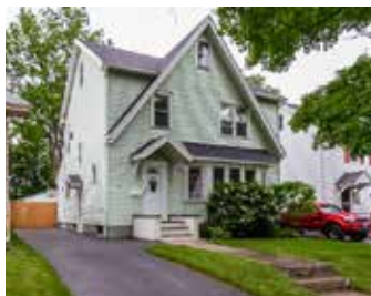
174 Spencer Rd - 9 offers!