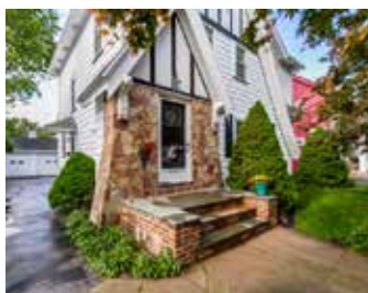
64 Westbourne Rd - 5 offers!