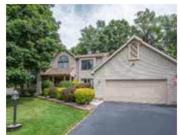
180 Willow Creek Ln