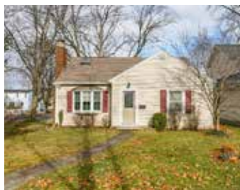
150 Garford Rd - 3 offers!