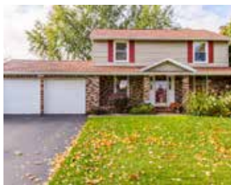
11 Sandhurst Dr - 6 offers!