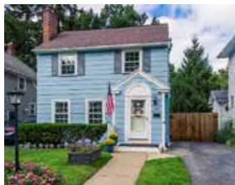
126 Catalpa Rd - 3 offers!