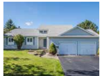
105 Sewilo Hills - 2 offers!