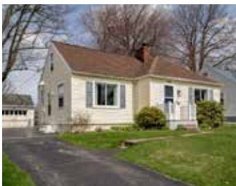
468 Spencer Rd - 4 offers!