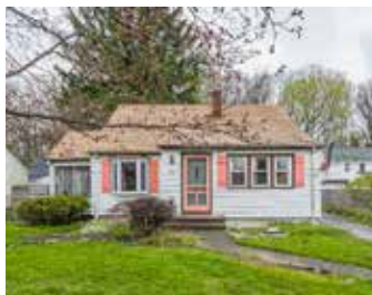
72 Birchwood Dr