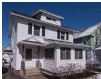
84 Fallstaff Rd - 3 offers!