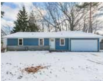
7 Ontario View - 12 offers!