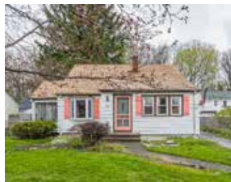
72 Birchwood Dr