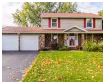
11 Sandhurst Dr - 6 offers!