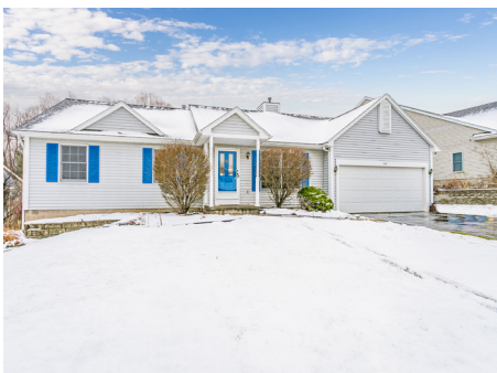
130 Sewilo Hills Dr 18 Showings, 7 offers