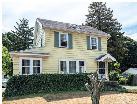
23 Orland Rd 19 Showings, 7 offers