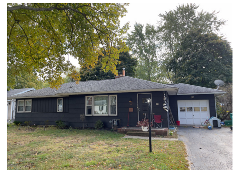
67 Cedargrove Dr 18 Showings, 5 offers