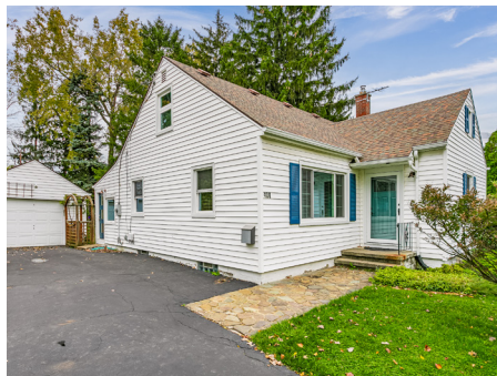
400 Pattonwood Dr 10 Showings, 6 offers