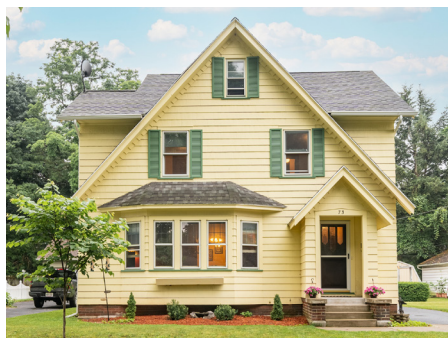
73 Rawlinson Rd 16 Showings, 5 offers