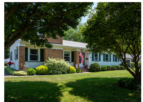
160 Brookview Dr 7 Showings, 2 offers