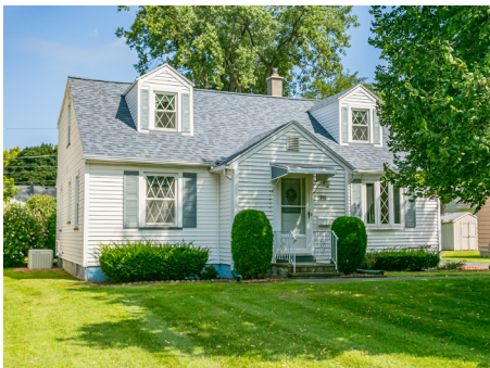
356 Orland Rd 23 Showings, 6 offers