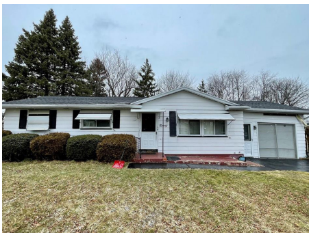
90 Impala Dr 45 Showings, 9 offers