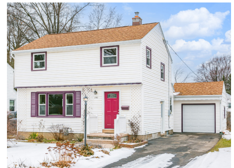
290 Winfield Rd 54 Showings, 24 offers