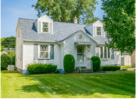
356 Orland Rd 23 Showings, 6 offers