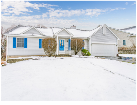
130 Sewilo Hills Dr 18 Showings, 7 offers