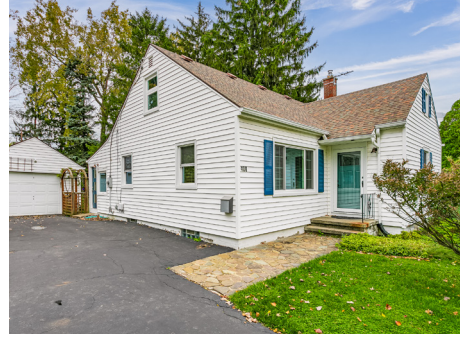
400 Pattonwood Dr 10 Showings, 6 offers