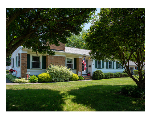
160 Brookview Dr 7 Showings, 2 offers