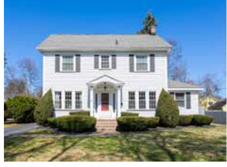
38 Barons Rd 32 Showings, 11 offers.