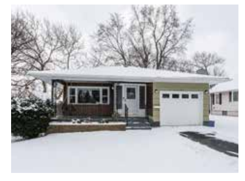
137 Heberton Rd 40 Showings, 5 offers.