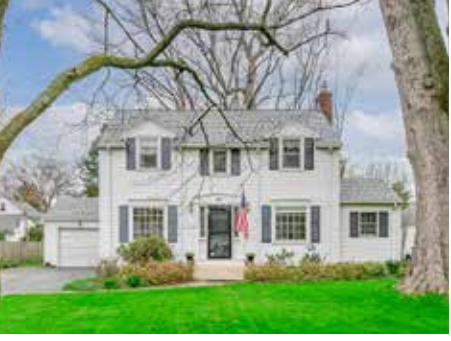
List Price $164,900, Sale Price $248,000