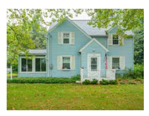
52 Seneca Rd 21 Showings, 11 offers.