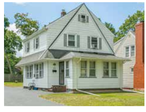
75 Pleasant Way 16 Showings, 3 offers.