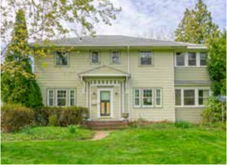
618 Lake Shore 29 Showings, 4 offers.