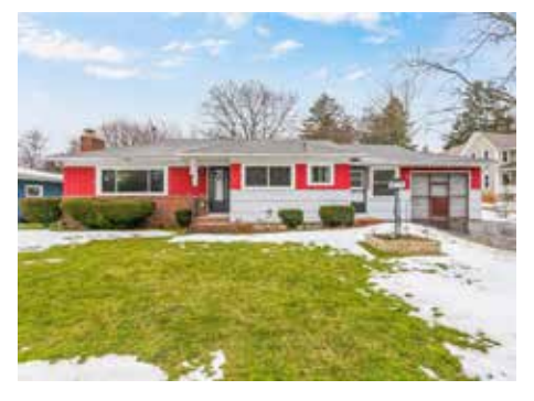
741 Helendale Rd 60 Showings, 21 offers.