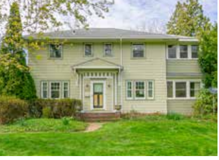
List Price $169,900. Sale Price $206,500