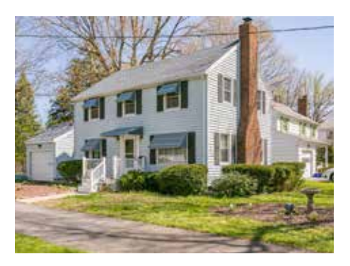
210 Seneca Rd 39 Showings, 11 offers.