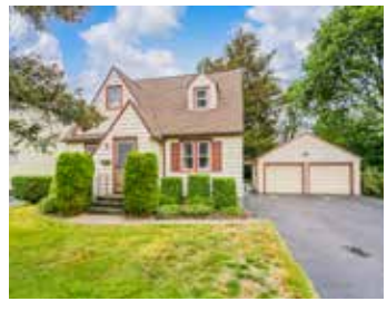
94 Winfield Rd 6 offers. 20 showings.