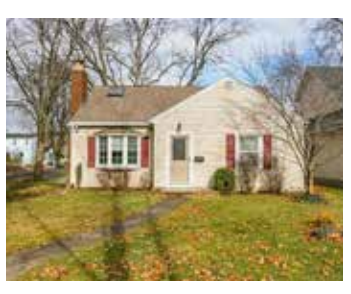
150 Garford Rd 3 offers. 17 showings.