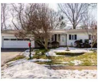
280 Lake Shore 9 offers. 55 showings.