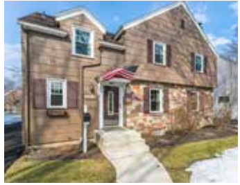
170 Thornton Rd 42 offers. 83 showings.