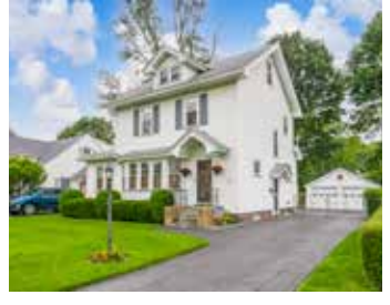
546 Westchester 7 offers. 8 showings.