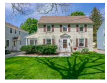
92 Seneca Rd 2 offers. 9 showings.