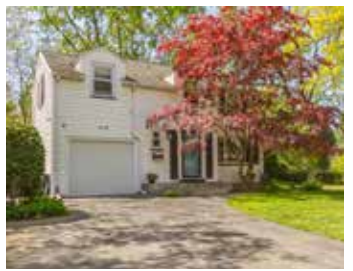
418 Brookview Dr 19 offers. 56 showings.