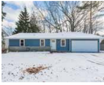
7 Ontario View 12 offers. 64 showings.