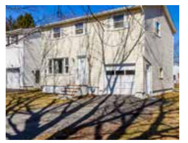
268 Wahl Rd 2 offers. 21 showings.