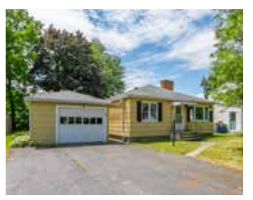
51 Traymore Rd 6 offers. 26 showings.