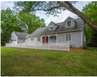
2727 Oakview Dr 7 offers. 8 showings