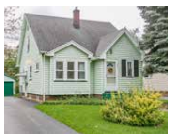
259 Seville Drive 5 offers. 18 showings.