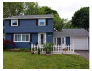
299 Coolidge Rd 8 offers. 42 showings.