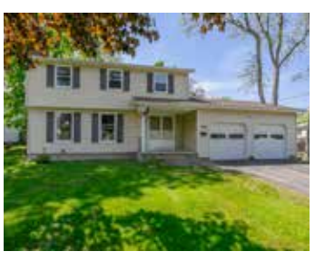
3985 Culver Rd 4 offers. 15 showings.