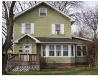
108 Brockley Rd 3 offers. 53 showings.